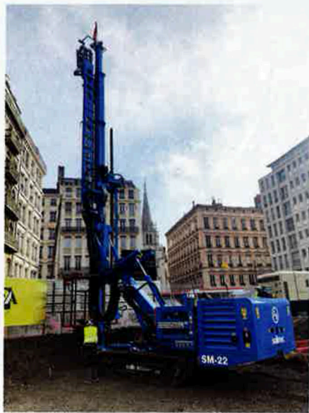
The Soilmec SM-22 is an evolution of the PSM-1350 and SM-20 models

BAUER MASCHINEN GROUP will present three PremiumLine heavy-duty rotary drilling rigs – BG 23 H, BG 33 and BG 45 – which it said would demonstrate the