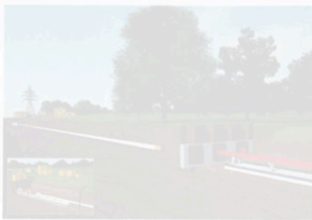
Herrenknecht's E-Power Pipe is a new method of installing small-diameter cable protection pipes

For the latest generation of these Grundodrill HDD rigs, a special new design has been developed. Tracto-Technik said the modular construction concept for