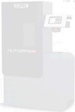
The new Automax Pro 3,000kN compression machine from Controls Group