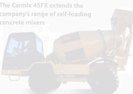
The Carmix 45FX extends the company's range of self-loading concrete mixers

It claims great agility with high productivity, making it suitable for situations requiring power, versatility and precision. At 4.5m high